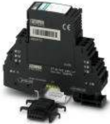
The figure shows the PT-IQ-1x2-24DC-UT version

Please be informed that the data shown in this PDF Document is generated from our Online Catalog. Please find the complete data in the user's documentation. Our General Terms of Use for Downloads are valid ( http://phoenixcontact.com/download )