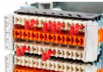
3M™ Disconnection Plug SOR FC on the 3M™ Integrated Splitter Block BRCP-SP