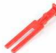
3M™ Disconnection Plug SOR FC