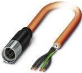
Cable plug in molded plastic, Length: 5 m, Color of outer sheath: orange RAL 2003

Please be informed that the data shown in this PDF Document is generated from our Online Catalog. Please find the complete data in the user's documentation. Our General Terms of Use for Downloads are valid ( http://phoenixcontact.com/download )