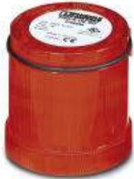
Permanent light element, 12 to 240 V AC/DC, red, without bulb

Please be informed that the data shown in this PDF Document is generated from our Online Catalog. Please find the complete data in the user's documentation. Our General Terms of Use for Downloads are valid ( http://phoenixcontact.com/download )