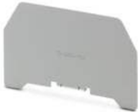
Separating plate, Length: 70 mm, Width: 4.8 mm, Height: 43.5 mm, Color: gray

Please be informed that the data shown in this PDF Document is generated from our Online Catalog. Please find the complete data in the user's documentation. Our General Terms of Use for Downloads are valid ( http://phoenixcontact.com/download )