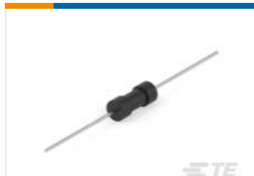
TE Part #3-2176471-2 HPCR 0819 A 10% 68R Std T&R HV