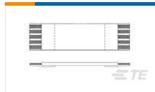
TE Part #2127674-1 FFC JUMPER, .050 C/L, 20-COND,