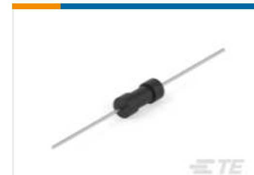
TE Part #3-2176471-3 HPCR 0819 A 10% 470R Std T&R HV