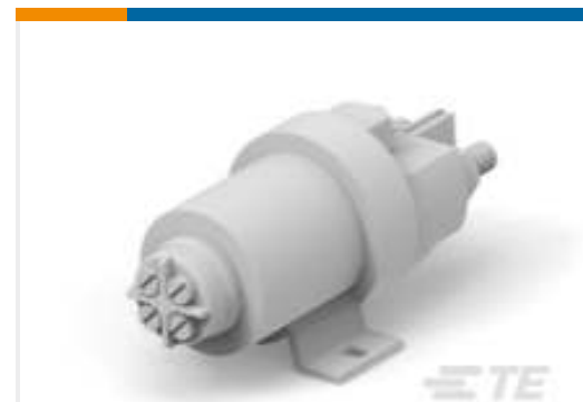
TE Part #K1013578 Relay 26-08-78