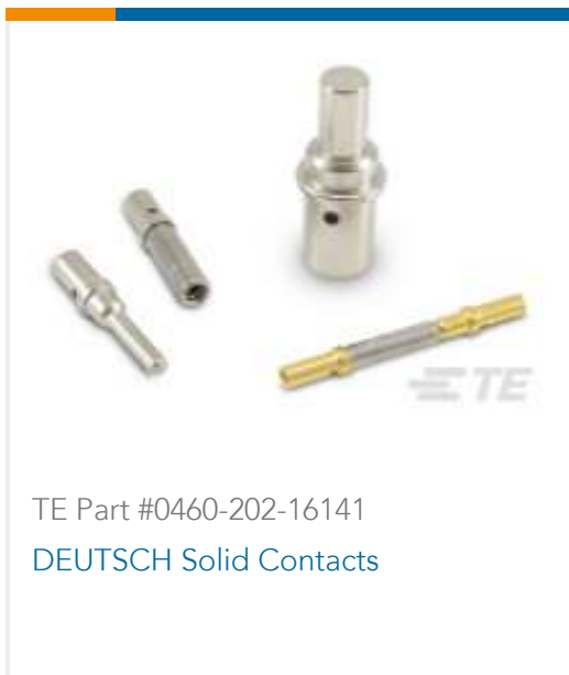
TE Part #0460-202-16141 DEUTSCH Solid Contacts