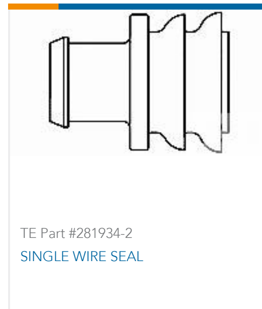
TE Part #281934-2 SINGLE WIRE SEAL