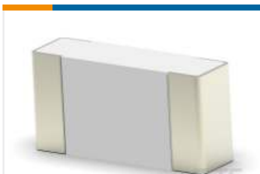
TE Part #3-2176243-2 CRGS0603 5% 390R