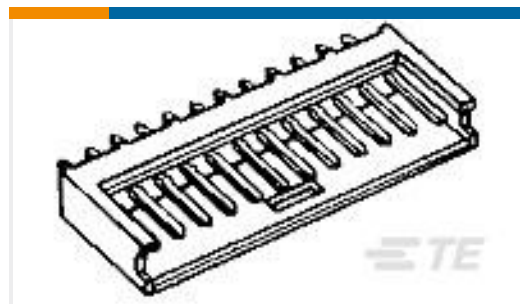
TE Part #280372-1 6P AMPMODU II SHRD HDR, ST, TIN