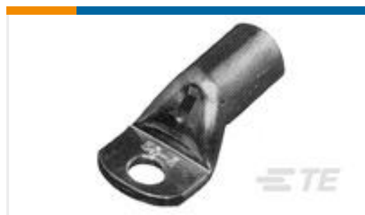
TE Part #710031-2 XCT 10-5