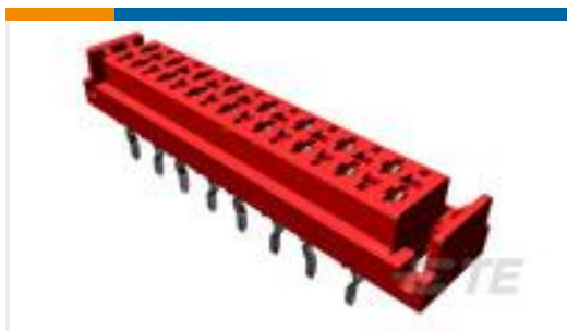
TE Part #1-338068-8 MICRO-MATCH FTE, 18P