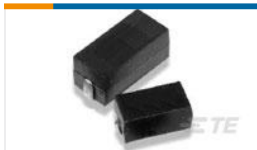
TE Part #3-1879021-9 SMW3 3R9 5%