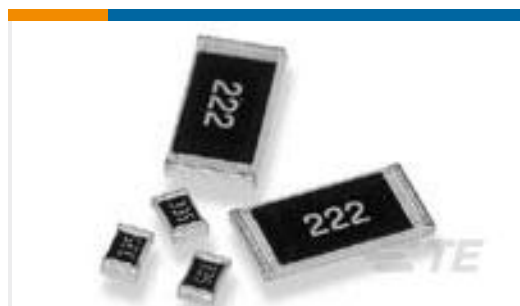
TE Part #1879502-4 CRGH2512 5% 18K 2W