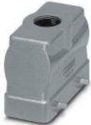
HEAVYCON B16 sleeve housing, for double locking latch, height: 65 mm, with 1 x M25 thread, straight cable outlet

Please be informed that the data shown in this PDF Document is generated from our Online Catalog. Please find the complete data in the user's documentation. Our General Terms of Use for Downloads are valid ( http://phoenixcontact.com/download )