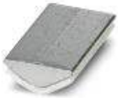
Insertion profile, Color: silver