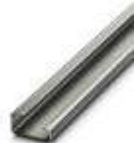
G-profile DIN rail, material: Steel, unperforated, height 15 mm, width 32 mm, length 2 m

DIN rail - NS 32 UNPERF 2000MM - 1201015