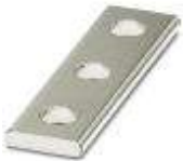
Connection rail, Color: silver