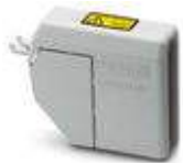
Covering hood, Width: 28.8 mm, Height: 59 mm, Color: gray