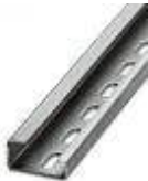
G-profile DIN rail, material: Steel, perforated, height 15 mm, width 32 mm, length 2 m

DIN rail - NS 32 UNPERF 2000MM - 1201015