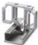
End clamp, for end support of UKH 50 - UKH 240, is pushed onto DIN rail NS 32 and fixed with 2 screws, width: 10 mm, color: Aluminum