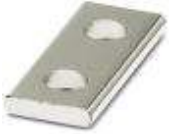
Connection rail, Color: silver