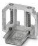
End clamp, for end support of UKH 50 to UKH 240, is pushed onto DIN rail NS 35 and fixed with 2 screws, width: 10 mm, color: aluminum