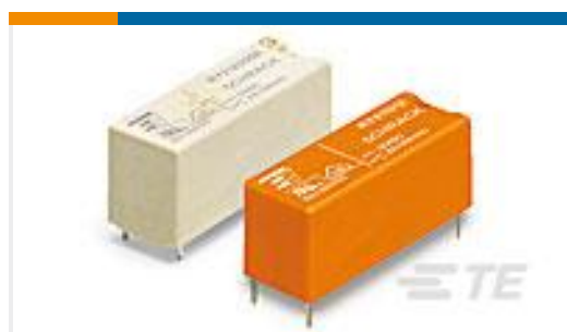
TE Part #1-1393225-7 RY611005