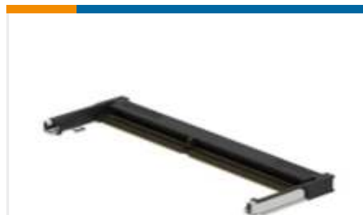
TE Part #2309409-2 DDR4 SO DIMM Sockets