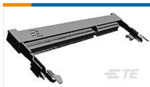
TE Part #2-2013310-1 EMBOSS TAPE DDR3 204P 9.2H STD