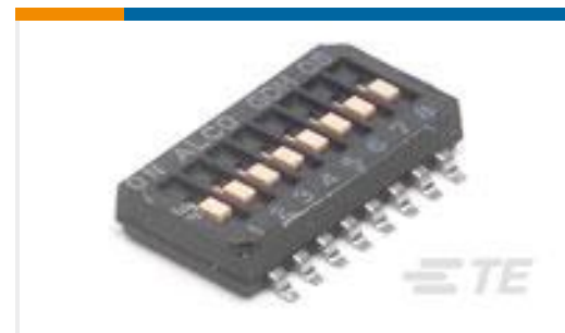
TE Part #1571983-9 GDH06STR04=DIP SWITCH