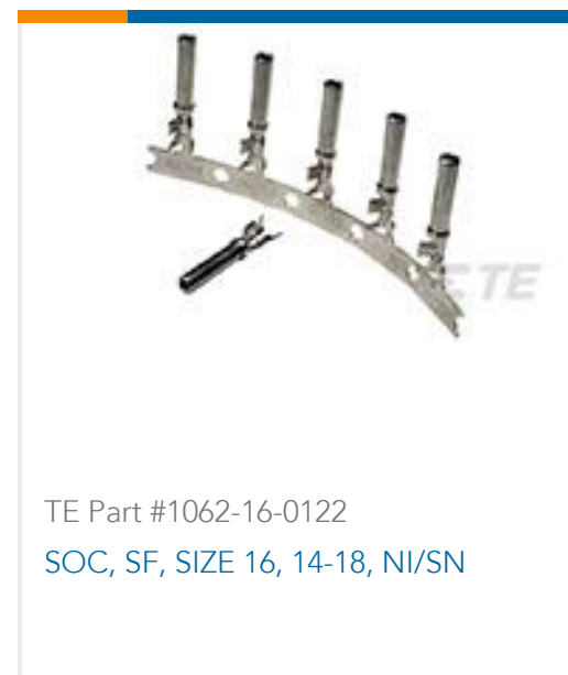
TE Part #1062-16-0122 SOC, SF, SIZE 16, 14-18, NI/SN