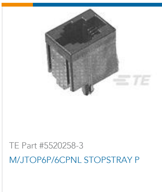
TE Part #5520258-3 M/JTOP6P/6CPNL STOPSTRAY P