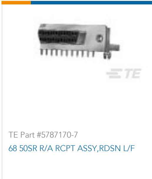
TE Part #5787170-7 68 50SR R/A RCPT ASSY,RDSN L/F