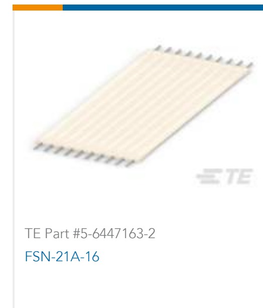
TE Part #5-6447163-2 FSN-21A-16