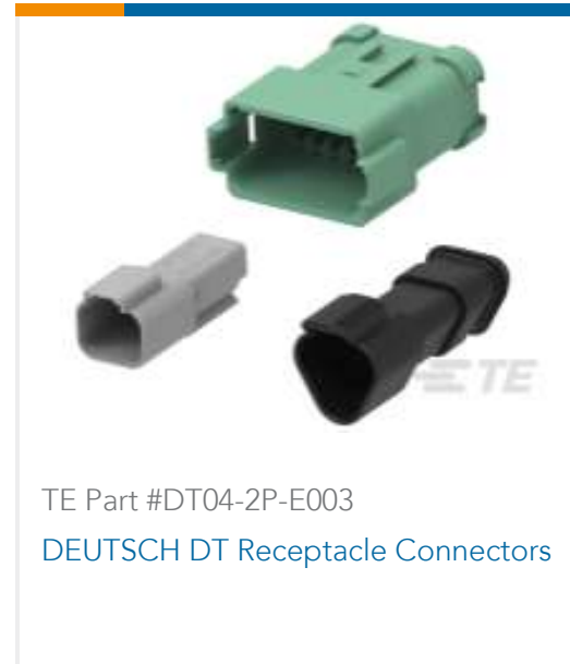
TE Part #DT04-2P-E003 DEUTSCH DT Receptacle Connectors