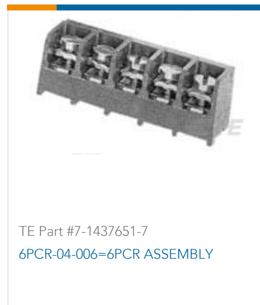
TE Part #7-1437651-7 6PCR-04-006=6PCR ASSEMBLY