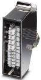
Sleeve housing, with EMC coating, metric

Please be informed that the data shown in this PDF Document is generated from our Online Catalog. Please find the complete data in the user's documentation. Our General Terms of Use for Downloads are valid ( http://phoenixcontact.com/download )