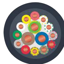
PUR/PVC black [PUR]