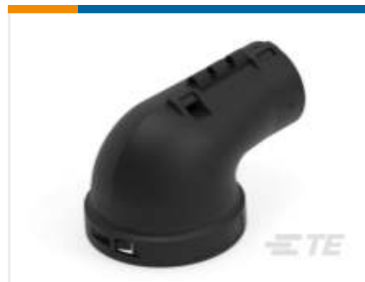
TE Part #1823735-1 COVER,90DEG