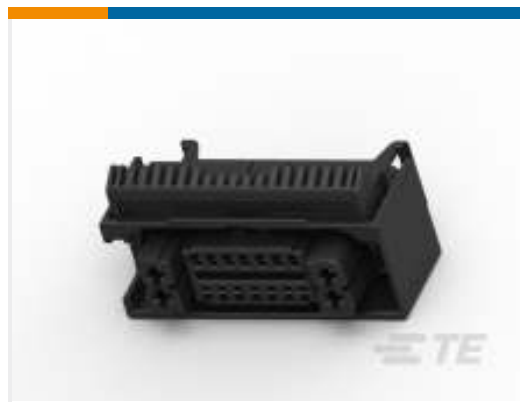
TE Part #1-2112780-9 18POS, MIXED,REC HSG,ASSY, SEALED