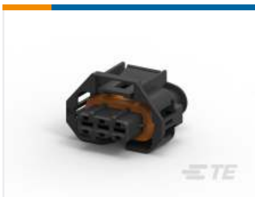
TE Part #2050049-2 3POS 2.8MM SENSOR PLUG ASSY