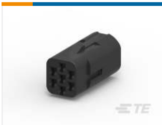
TE Part #2822343-3 MINI MLC PLUG HSG ASSY 7P