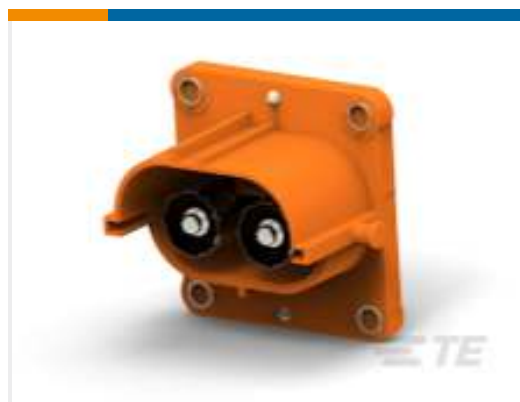
TE Part #3-2322122-2 HVP800 2P HEADER ASSY