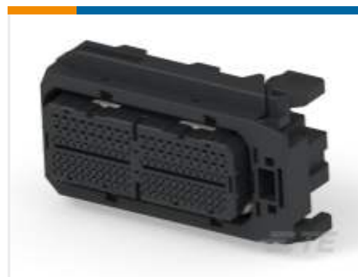
TE Part #2260792-1 0.5/1.0 SEALED PLUG ASSY 130POS