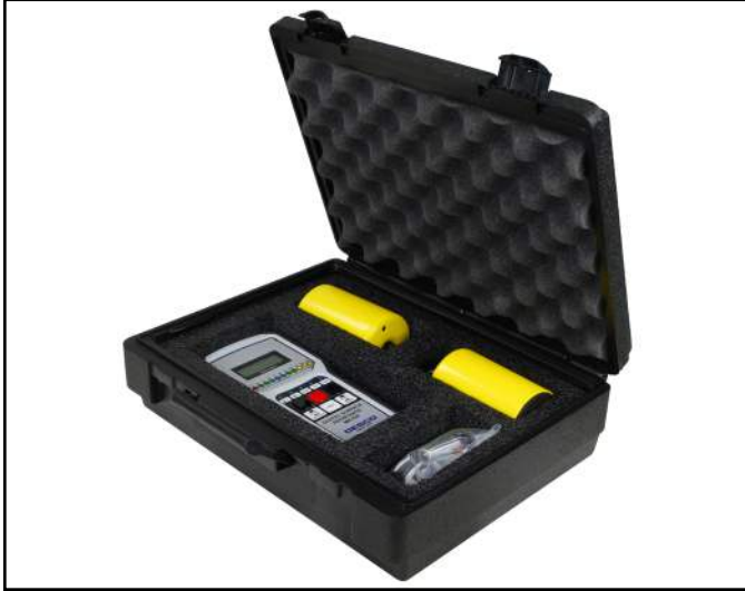
Figure 2. Desco 19787 Digital Surface Resistance Meter Kit