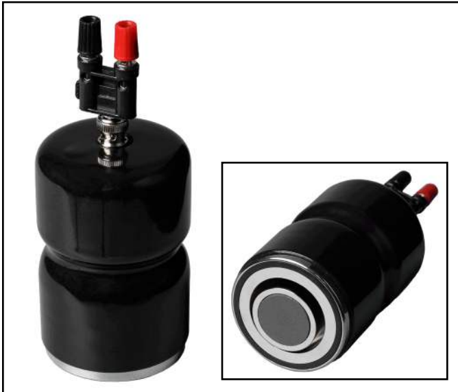
Figure 7. Desco 50005 Concentric Ring Probe

The Desco 50005 Concentric Ring Probe is an instrument to be used in conjunction with a resistance meter, such as the Desco 19787 Digital Surface Resistance Meter, to measure surface resistance per ANSI/ESD STM11.11 the test method listed in Packaging standard ANSI/ESD S541 for surface resistance of planar materials.