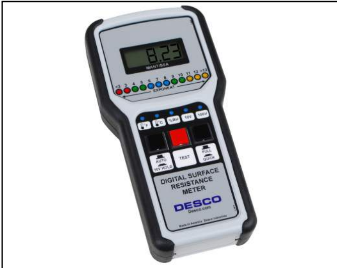
Figure 3. Desco 19788 Digital Surface Resistance Meter