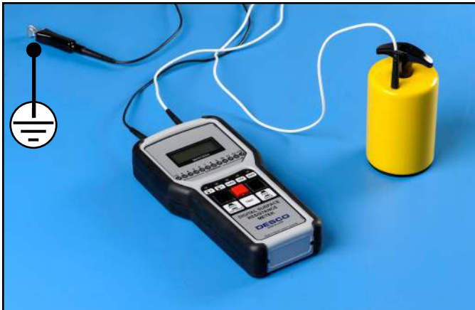
Figure 5. Rtg test setup

If the measurement is outside acceptable limits, clean the surface with an ESD cleaner containing no insulative silicone such as Reztore™ Antistatic Surface & Mat Cleaner , and re-test to determine if the cause of failure is an insulative dirt layer or the ESD worksurface material.