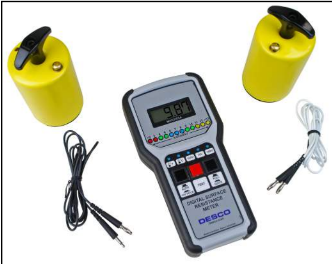
Figure 1. Desco Digital Surface Resistance Meter Kit