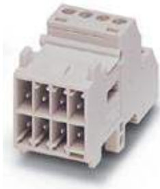
Contact insert module, for panel mounting frames, with screw connection, 7-pos. + PE connection, 160 V / 10 A

Please be informed that the data shown in this PDF Document is generated from our Online Catalog. Please find the complete data in the user's documentation. Our General Terms of Use for Downloads are valid ( http://download.phoenixcontact.com )