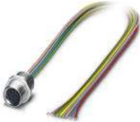
Sensor/actuator flush-type socket, 8-pos., M8, front/screw mounting with M10 fastening thread, with 0.5 m TPE litz wire, 8 x 0.14 mm 2

Please be informed that the data shown in this PDF Document is generated from our Online Catalog. Please find the complete data in the user's documentation. Our General Terms of Use for Downloads are valid ( http://download.phoenixcontact.com )