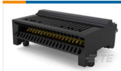
TE Part #1551920-2 zQSFP+ connector assembly