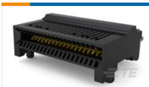
TE Part #1551920-1 zQSFP+ connector assembly