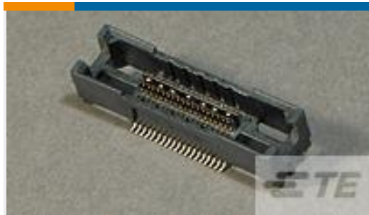
TE Part #5767054-1 MICT,RECPT,38,ASSY,PDNI