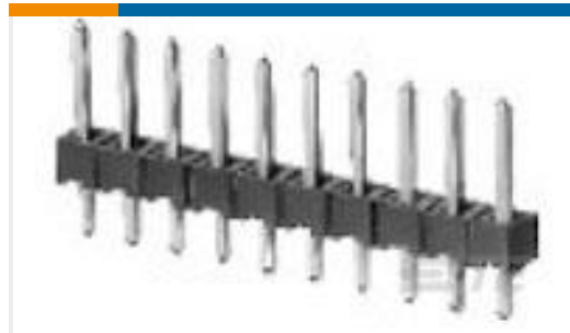
TE Part #5-146281-3 03 MODII HDR SRST B/A LF