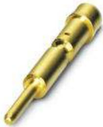
Turned 1.0 mm crimp contact, single male contact, conductor cross section 0.14 - 0.5 mm 2 , gold-plated

Please be informed that the data shown in this PDF Document is generated from our Online Catalog. Please find the complete data in the user's documentation. Our General Terms of Use for Downloads are valid ( http://download.phoenixcontact.com )