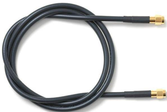
Model 4846-C SMA Plug to SMA Plug, RG58C/U

Small size, and durability for confident connections