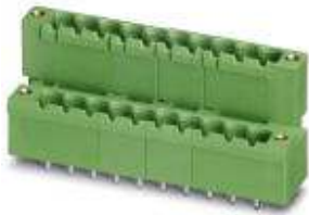
The figure shows a 10-pos. version with 20 contacts

Please be informed that the data shown in this PDF Document is generated from our Online Catalog. Please find the complete data in the user's documentation. Our General Terms of Use for Downloads are valid ( http://phoenixcontact.com/download )