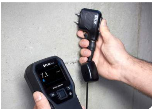
External pin probe for resistive moisture readings