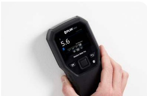
Verify moisture with pinless measurements