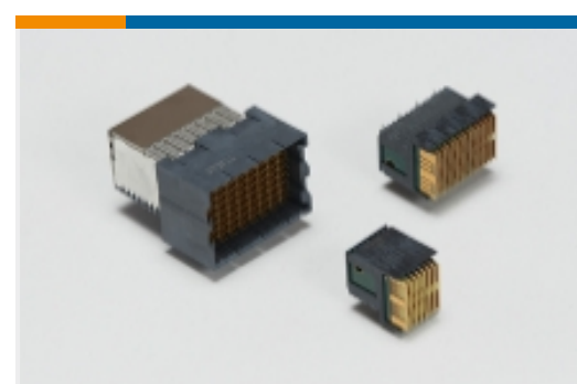
High Speed Backplane Connectors(41)