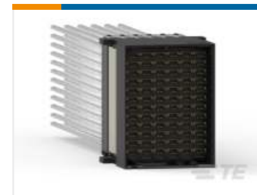
TE Part # 5-2320907-6 C/A,12P6C 100 OHM PIR CBL STRADA WHISPER