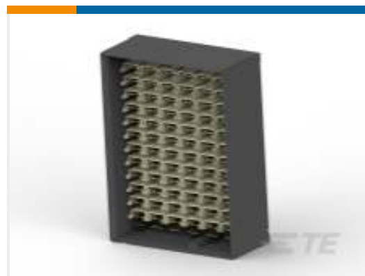
TE Part # 2187544-1 SW PIR HDR BP, 100OHM, 12X6 DEW