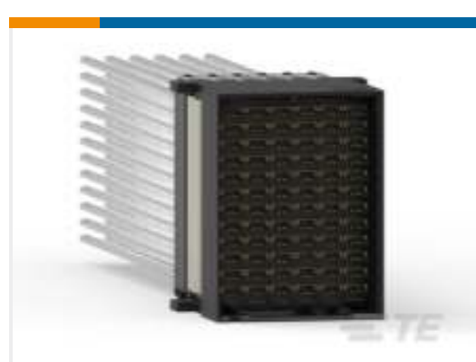
TE Part # 6-2320907-6 C/A,12P6C 100 OHM PIR CBL STRADA WHISPER