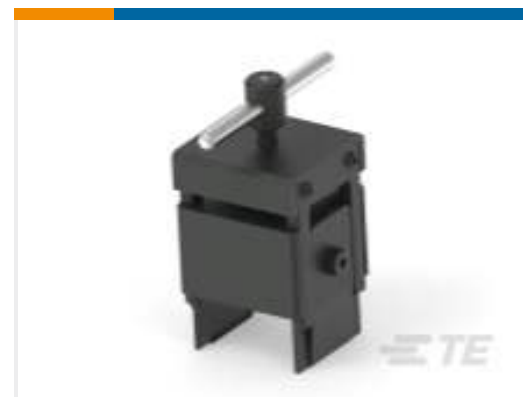
TE Part # 2185279-1 ASSY, EXTRACTION TOOL