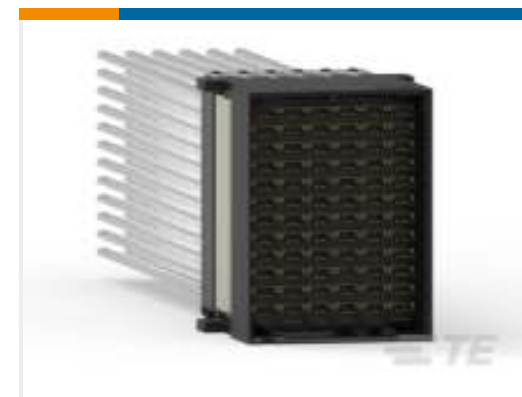
TE Part # 3-2320907-6 C/A,12P6C 100 OHM PIR CBL STRADA WHISPER