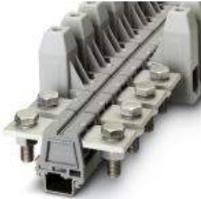
Universal terminal block with bolt connection, cross section: 50 - 150 mm 2 , width: 46 mm, color: gray

Please be informed that the data shown in this PDF Document is generated from our Online Catalog. Please find the complete data in the user's documentation. Our General Terms of Use for Downloads are valid ( http://download.phoenixcontact.com )