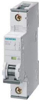
Miniature circuit breaker 230/400 V 10kA, 1-pole, D, 50 A, D=70 mm