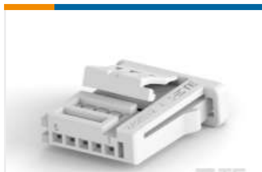
TE Part #2282154-2 6POS,NANOMQS,REC HSG,CODB