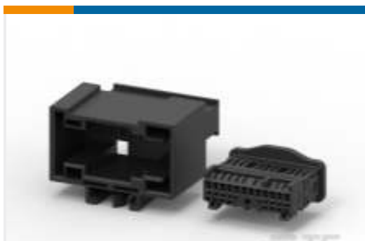
TE Part #1534100-1 MQS, CONNECTOR HOUSING