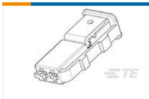
TE Part #1563189-1 2POS,MT 2,REC HSG,CODA