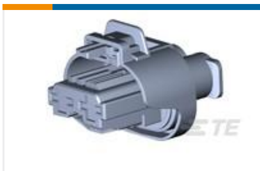
TE Part #1544650-3 PC 2V 8NG1 GRIS JT