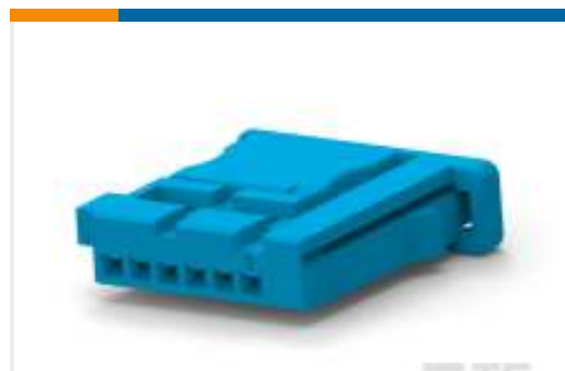
TE Part #2282154-3 6POS,NANOMQS,REC HSG,CODC