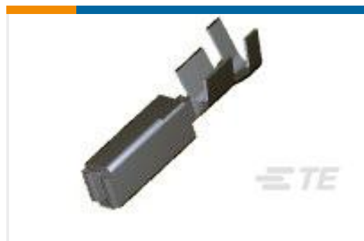
TE Part #1-1355877-1 AMP MCP 2.8, CONTACT LANCELESS