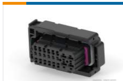
TE Part #2298567-1 22POSN.,REC ASSY, MCON1.2, MQS, MCP2.8