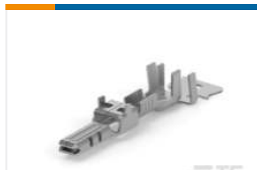
TE Part #2238067-1 PTL TAB CONTACT, 18 AWG