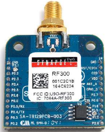
Pictured is the RF300PD1 Module

SNAP's on-board Python interpreter provides for rapid application development and over-the-air programming, while Silicon Laboratories' low-power RF single-chip design saves board space and lowers the overall Bill of Materials and power consumption. The RF300 is approved as an FCC Part 15 unlicensed modular transmitter. The modules provide up to 16 channels of operation in the ISM 868MHz or 915MHz frequency bands. The on-board Si1000 transceiver contains both a power amplifier for transmission and a low noise amplifier in the receive path for extended range.