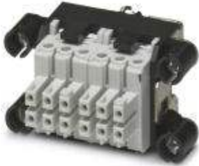
Contact insert set for sleeve side, sleeve frame with PE, 4 fixing screws, 6-pos. contact inserts preassembled, 6 coding profiles

Please be informed that the data shown in this PDF Document is generated from our Online Catalog. Please find the complete data in the user's documentation. Our General Terms of Use for Downloads are valid ( http://phoenixcontact.com/download )