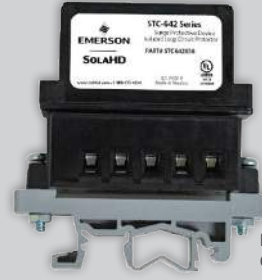
Plug-in Module with Optional DIN Rail Mounting Clip