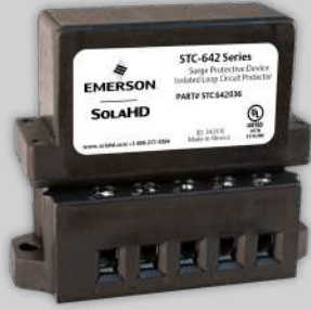
Plug-in Module with Standard Base