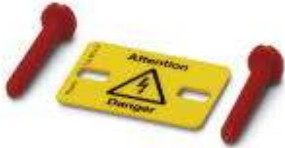
The illustration shows version WS 4-8

Warning label, Plate, orange, labeled: Lightning flash and warning in English, Mounting type: Screws, rivets, for terminal block width: 14 mm