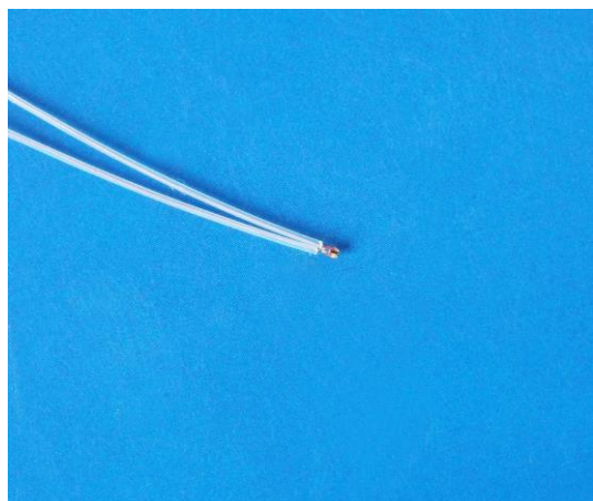
Figure 1.2 The physical photo of ATH10KR8BT65