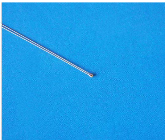
Figure 1.1. The physical photo of ATH10KR8B