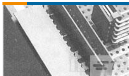
TE Part #281695-5 HEADER HE14 STRAIGHT 5 P