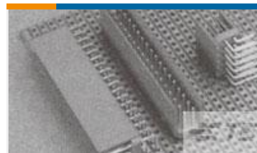
TE Part #281742-3 HEADER HE14 RA 2X3 P