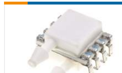
TE Part #4525-DS5A001DP PRESS XDCR, ANALOG, PSI RANGE