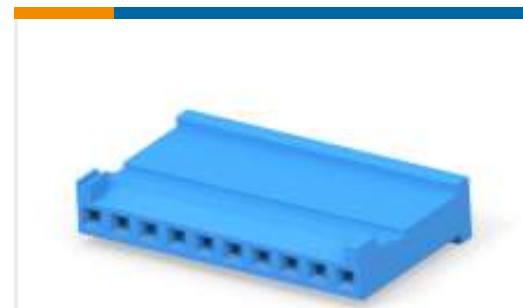
TE Part #1-281838-0 HE13/HE14 Crimp Housings