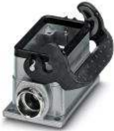
Box mounting base, with single locking latch, height 52 mm, with screw connection, 2x Pg16

Please be informed that the data shown in this PDF Document is generated from our Online Catalog. Please find the complete data in the user's documentation. Our General Terms of Use for Downloads are valid ( http://phoenixcontact.com/download )