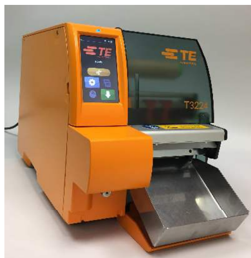
T3224 fitted with a Cutter & catch tray