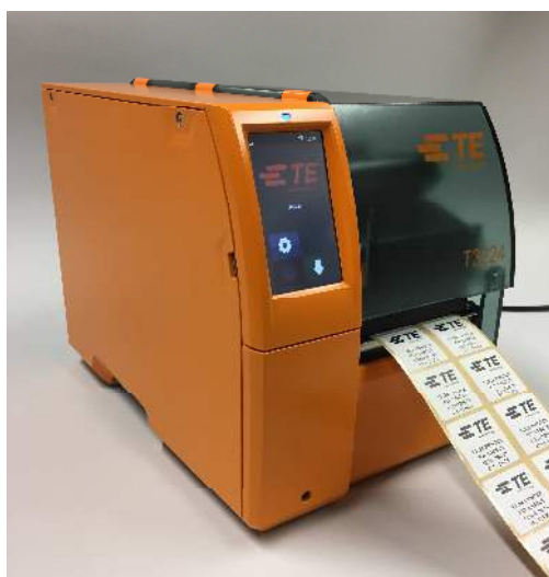
T3224 printing labels

For more details regarding printer accessories please consult TTDS-260, and for more details concerning the Universal payoff please consult TTDS-259.