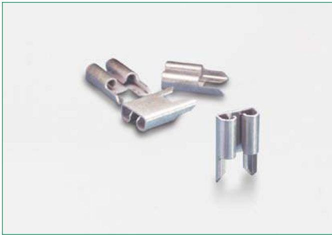
Dimensions in mm / Maße in mm