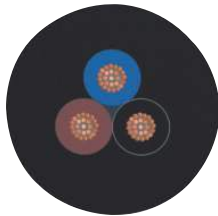
PUR halogen-free black [PUR]