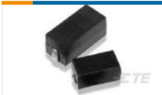
TE Part #2-1879021-3 SMW3 R82 5%