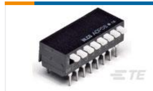
TE Part #2-1571999-9 ADP08STR04=PIANO DIP SWITCH