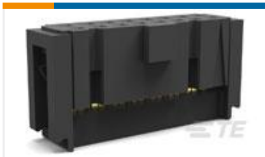
TE Part #1658527-7 622-1641LF FEM SOCKET,LEAD FREE