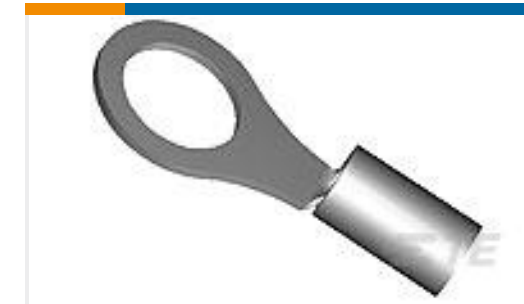
TE Part #170721-2 SOLISTRAND RINGTONG