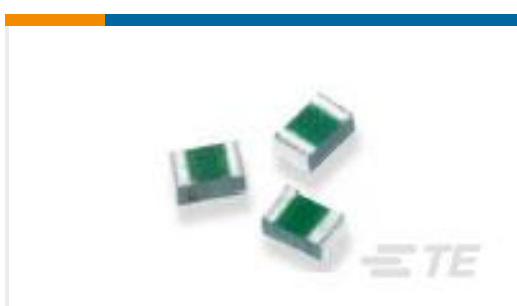
TE Part #1624348-2 NTC0805 5% 15K