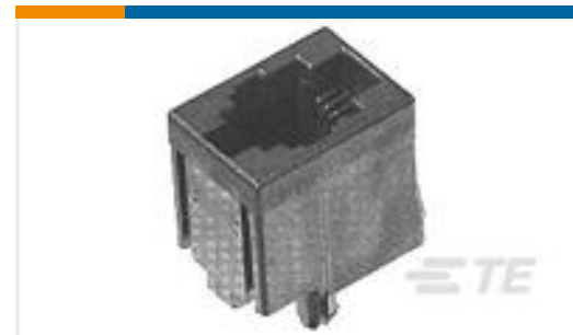
TE Part #5520260-4 MJ,TE,8P/8C,PNL STOPS,KEYED