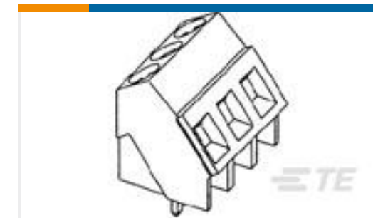
TE Part #796690-6 TERMI-BLOK PCB MOUNT 6P