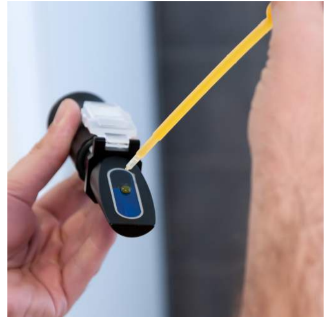
LED Refractometer PCE-Oe-LED