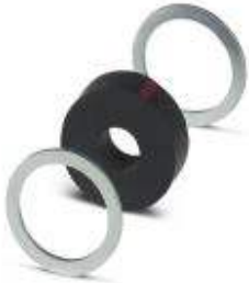
Notched seals/2 washers, for pressure screws, type Pg21

Please be informed that the data shown in this PDF Document is generated from our Online Catalog. Please find the complete data in the user's documentation. Our General Terms of Use for Downloads are valid ( http://download.phoenixcontact.com )