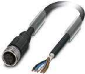
Sensor/Actuator cable, 5-position, PUR/PVC, Black-gray RAL 7021, shielded, Free cable end, on Socket straight M12, A-coded, Cable length: 10 m

Please be informed that the data shown in this PDF Document is generated from our Online Catalog. Please find the complete data in the user's documentation. Our General Terms of Use for Downloads are valid ( http://download.phoenixcontact.com )