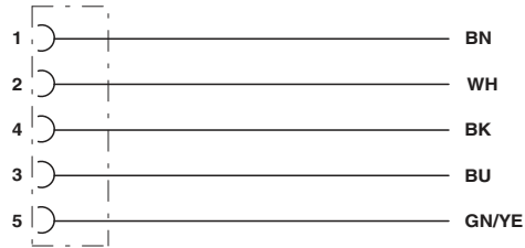
Contact assignment of the M12 plug and the M12 socket