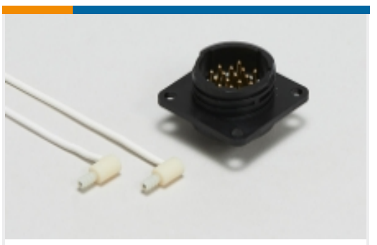
Circular Power Connectors(2)