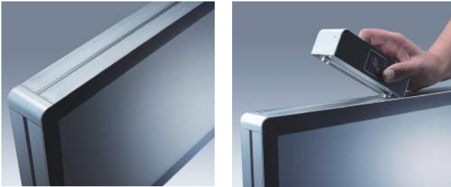
Side groove design for Flexible peripheral device