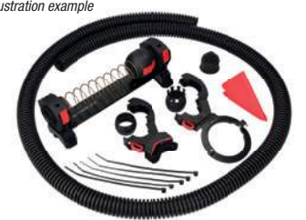
Abb. beispielhaft Illustration example