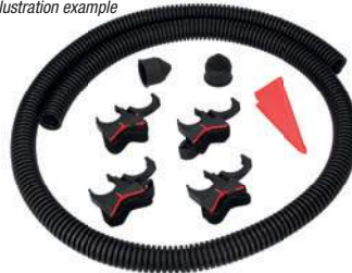
Abb. beispielhaft Illustration example