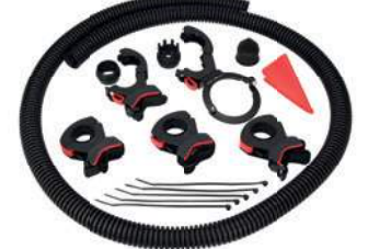
Abb. beispielhaft Illustration example