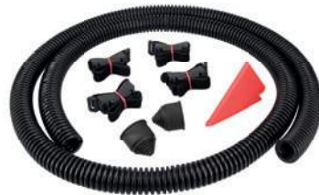
Abb. beispielhaft Illustration example