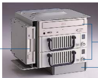
One 3.5" drive bay