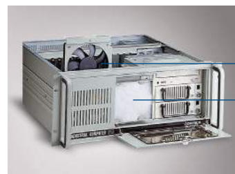
One 85-CFM hot-swap cooling fan