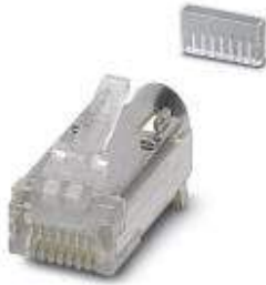
RJ45 pin insert, CAT5e, 8-pos., shielded, IDC connection method, for litz wires AWG 27 ... 26, with strain relief

Please be informed that the data shown in this PDF Document is generated from our Online Catalog. Please find the complete data in the user's documentation. Our General Terms of Use for Downloads are valid ( http://download.phoenixcontact.com )