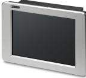
15-in. display shown

Please be informed that the data shown in this PDF Document is generated from our Online Catalog. Please find the complete data in the user's documentation. Our General Terms of Use for Downloads are valid ( http://download.phoenixcontact.com )