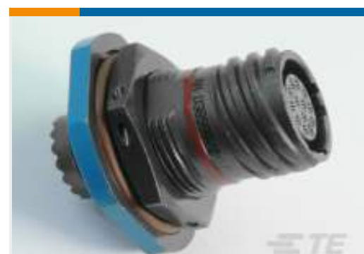
TE Part #YDTS24F17-35SNV001 RECP ASSY