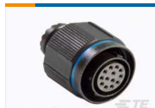
TE Part #YDTS26F25-19SNV001 PLUG ASSY