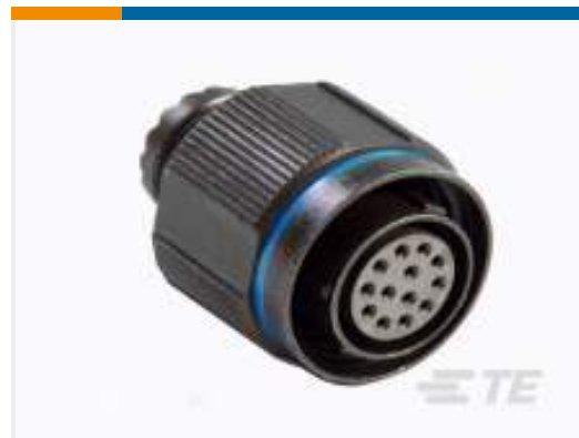
TE Part #YDTS26F19-35PAV001 PLUG ASSY