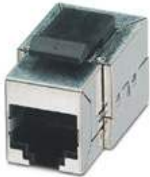
RJ45 socket insert, modular (Keystone), CAT3, 8-pos., shielded, with cable connection (IDC)

Please be informed that the data shown in this PDF Document is generated from our Online Catalog. Please find the complete data in the user's documentation. Our General Terms of Use for Downloads are valid ( http://download.phoenixcontact.com )