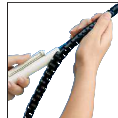
Grasp end of Pan-Wrap™ Split Harness Wrap and bundle while pulling the tool along the bundle length.