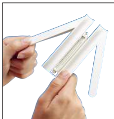
Open Pan-Wrap™ Tool and insert bundle.