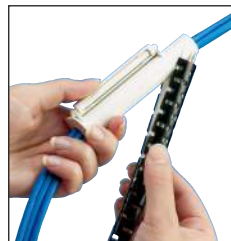
Slide Pan-Wrap™ Split Harness Wrap onto end of tool until approximately 3" of it covers the bundle.